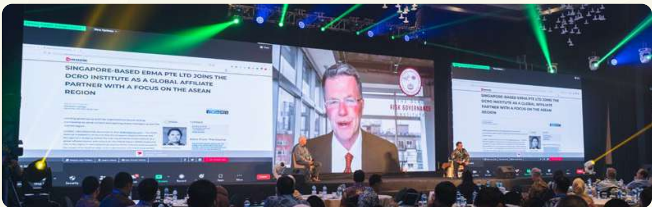
Risk Beyond 2022, Bali Indonesia

In the Risk Beyond 2023 International Conference, risk professionals would be able to devote two full days in the company of more than 300 national and regional risk management professional peers, within a learning and sharing environment. Thus, it is an excellent place to exchange experiences and knowledge.