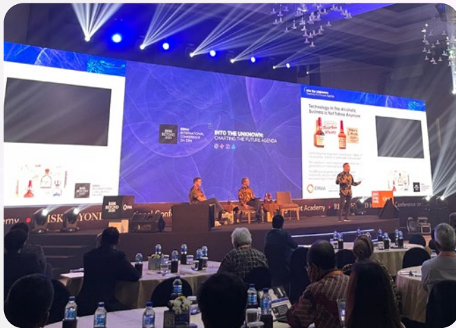
Risk Beyond 2023, Bali Indonesia

Risk Beyond International Conference on Enterprise Risk Management 2024 will be held on December 5-6, 2024, taking place at the beautiful and luxurious The Anvaya Beach Resort Bali, Indonesia.